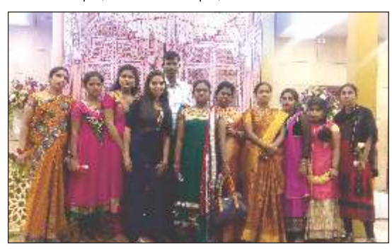
On 2nd June 2018, Children, Teachers & Staff visited Novotel Hotel for a wedding