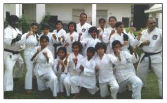
On 25th November, 2017 5 girls went to Khammam for Karate Competition. They won 2 Gold, 2 Silver and a Bronze Medal. It was organized by Telangana & Andhra Pradesh Karate Association.