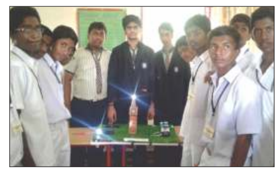
On 3rd September, 2017 children went to Meridian School for a Science Exhibition.