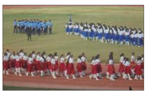
Balika Bhavan Children participated in International School Sports Day