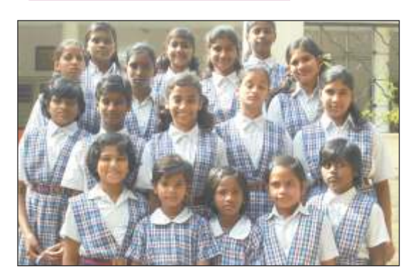
Students of International School