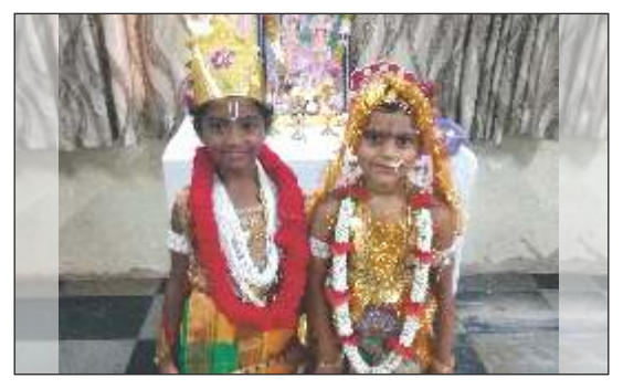
On 3rd September 2018 Krishnastami was celebrated.