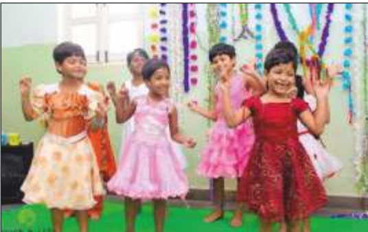
On 14th Nov, 2016 Children's day Celebrations at Vejbai Bal Nivas