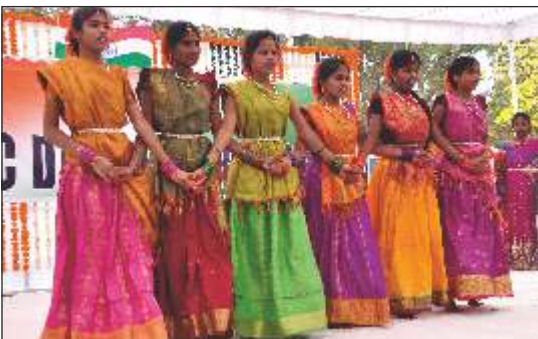
Dance by Balika Bhavan Girls