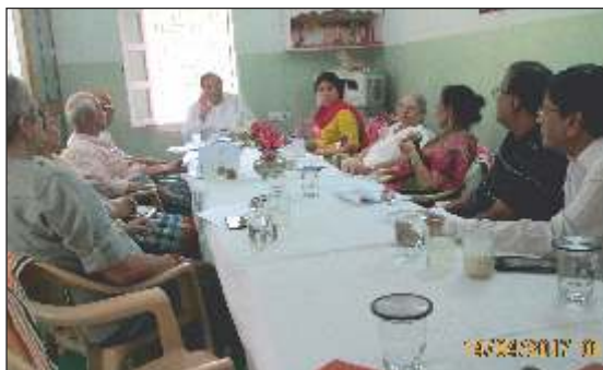
16th April Managing Committee meeting was held at Vejbai Bal Nivas, Shivarampally