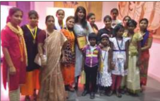
On 14th May, 2017 children visited Birla Mandir auditorium for a 'touch a life' program.