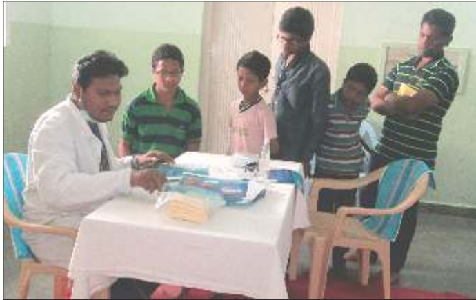
On 20th November, 2016 ST. Johns Lodge conducted a Medical camp at Vejbai Bal Nivas.

On 25th June, 2017 Rimini Street India Operation Pvt. Ltd. conducted a health camp.