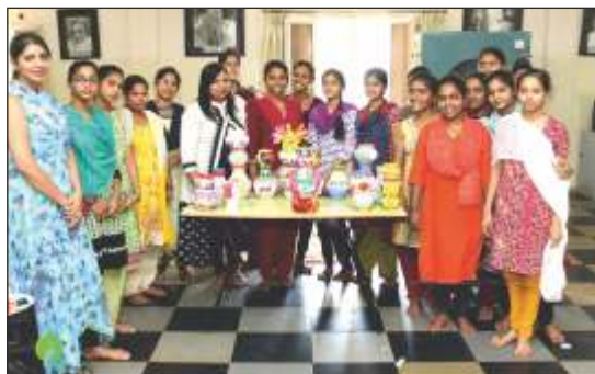
On 17th April to 7th May, 2017 Touch a Life foundation organized a summer camp