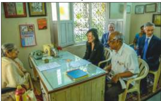
On 6th January, 17 Rimini Street India Operations Pvt. Ltd., visited our home with Foreigners from U.K.