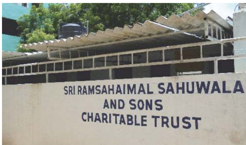
M/s. Sri Ram Sahaimal Sahuwala & Sons Charitable Trust for donation Rs.2,50,000/- for renovation of Bathrooms and toilets block at R.K.Homes, Nanal Nagar.

for Grant-in-Aid for the year 2016-2017 of Rs. 2,44,000/-.