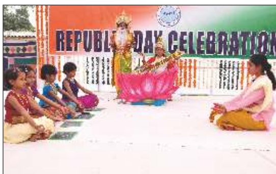
Saraswati Skit by V.K.Dhage School Children