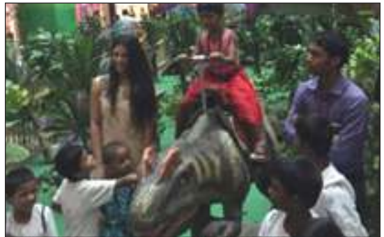
On 24th May, 2017 May children went to the FORUM mall with touch a Life Foundation Group