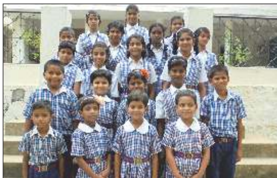
Students of International School