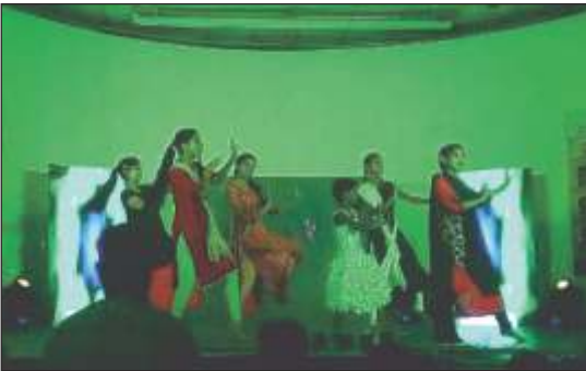
On 14th May, 2017 children visited Birla Mandir auditorium for a 'touch a life' program.