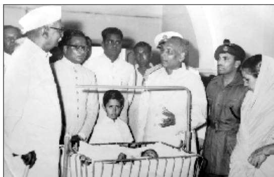
Dr. Rajendra Prasad, the first President of Independent India visited R. K. Homes.