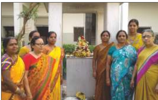
On 1st Feb, 2017 Vasantha Panchami was celebrated at V.K.Dhage School