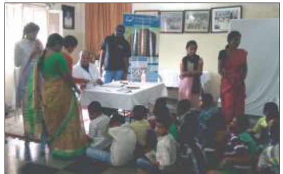
On 25th June, 2017 Rimini Street India Operation Pvt. Ltd. conducted a health camp