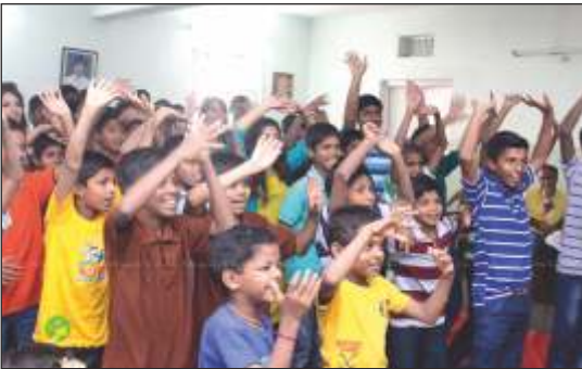
On 14th Nov, 2016 Children's day Celebrations at Vejbai Bal Nivas