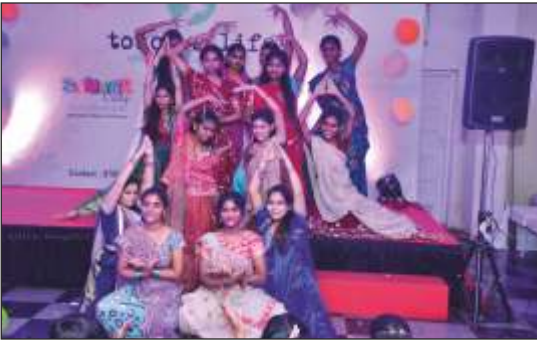
On 17th April to 7th May, 2017 Touch a Life foundation organized a summer camp.