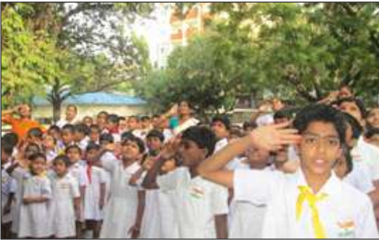
Independence Day Celebrations in V.K.Dhage School