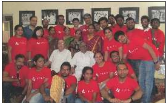
An Educational Camp conducted by Altura Consulting Company