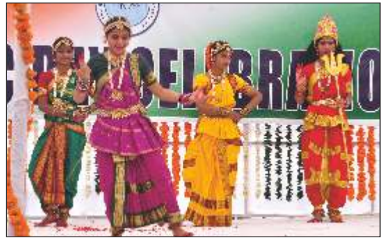
Cultural Programme by V.K. Dhage School Children