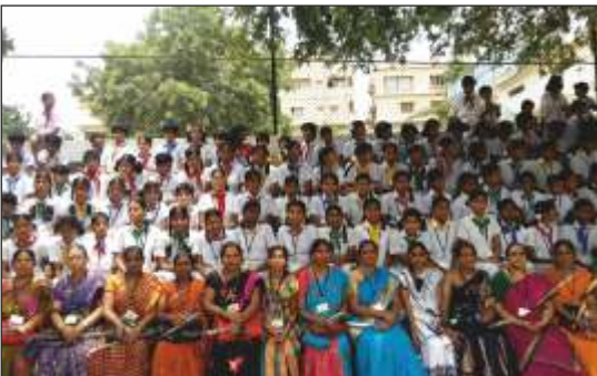
Teachers day Celebrations in International School