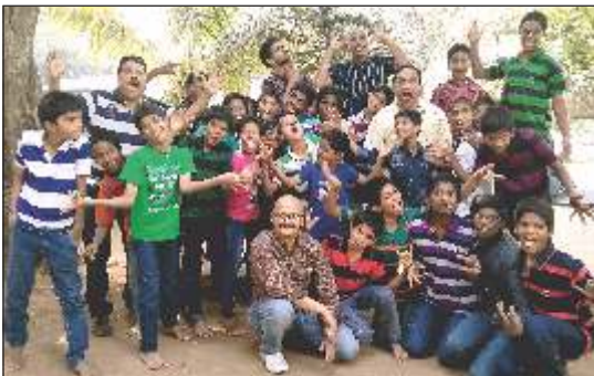
On 20th November, 2016 ST. Johns Lodge conducted a Medical camp at Vejbai Bal Nivas.