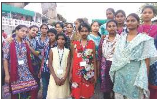
On 17th May, 2017 children went to Gandipet for picnic