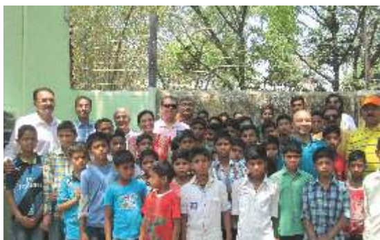
On 9th April, 2017 Rotary Club of Hyderabad inaugurated renovated Toilet Block at Shivarampally. They spent Rs. 3.50 Lakhs for this project.