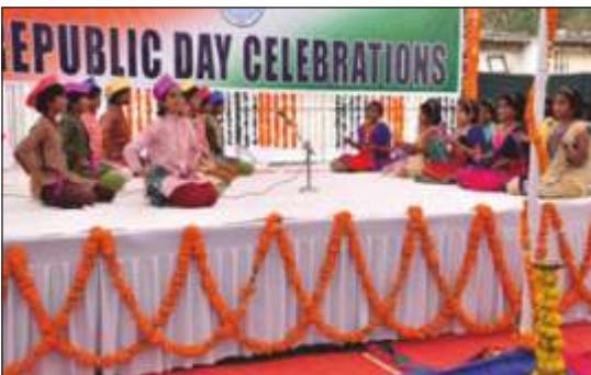
Cultural Programme by V.K.Dhage School Children