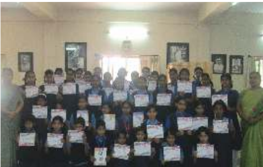
Maruti Art Academy Conducted Painting Competitions On 18th September, 2016 children won 2 Gold medals and one Silver Medal