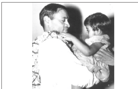
Former Prime Minister of India Sri P. V. Narasimha Rao Visited R. K. Homes