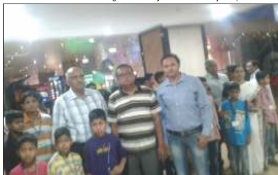
From 3rd to 10th, April, 2017 all the children of Hyderabad Children's Aid Society visited Mantra Mall for Indoor Games and activities.