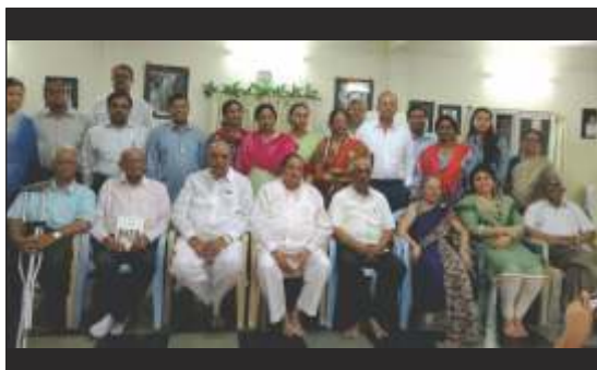
Annual General Body meeting was held on 8th September, 2016.