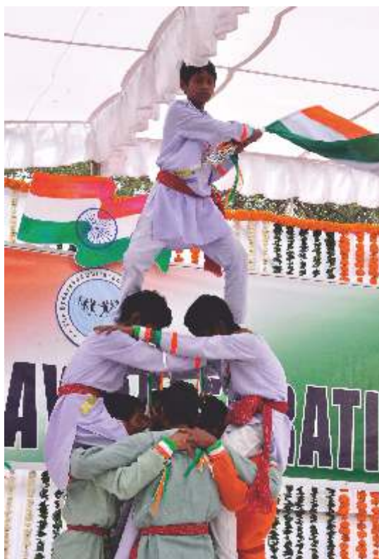
Pyramid by Vejbai Bal Nivas Boys

From 3rd to 10th, April, 2017 all the children of Hyderabad Children's Aid Society visited to Mantra Mall for Indoor Games and activities.