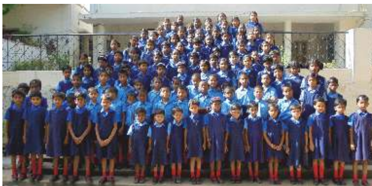
Students of V.K.Dhage School