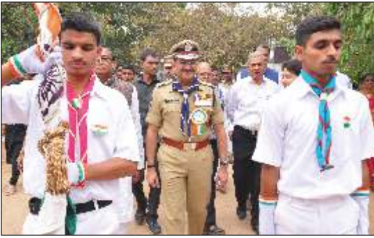
Gaurd of Honour by Vejabai Bal Nivas Boys