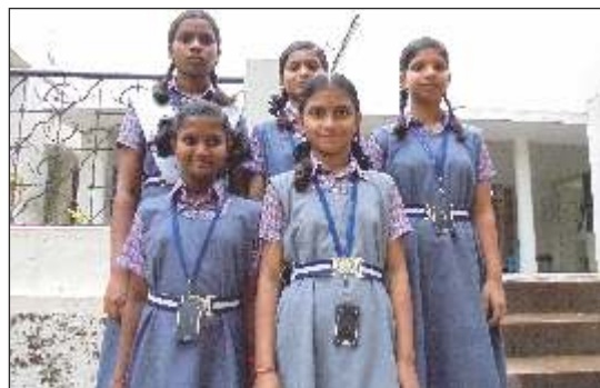
Students of Gowtham Vidhyalaya High School