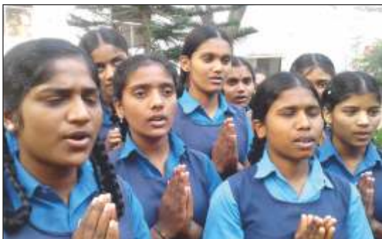
On 1st Feb, 2017 Vasantha Panchami was celebrated at V.K.Dhage School