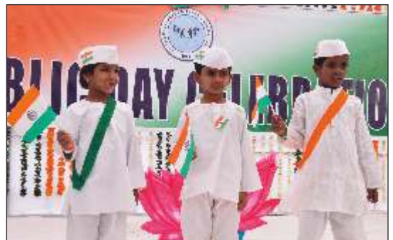
Patroito Song by V.K.Dhage School Children