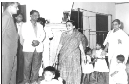
Former Chief Minister of A.P and Actor Sri. N.T Rama Rao Visited the R.K.Homes