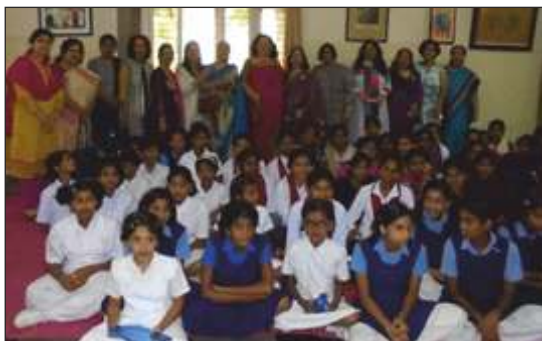
On 14th July, 17 children did a show for Inner Wheel Club of Hyderabad Central-315.