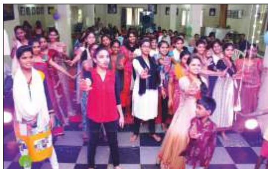
17th April to 7th May, 2017 Touch a Life foundation organized a summer camp.