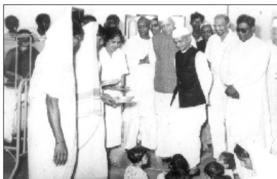
Sri Lal Bahadur Shastri visited R. K. Home

All these great personalities have inspired us to keep the lamp burning.