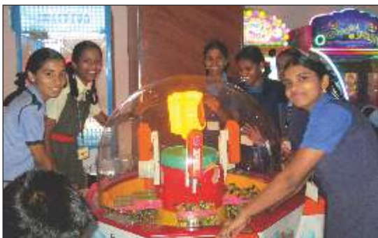
From 3rd to 10th, April, 2017 all the children of Hyderabad Children's Aid Society visited Mantra Mall for Indoor Games and activities.