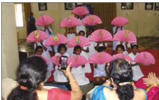
On 14th July, 17 children did a show for Inner Wheel Club of Hyderabad central-315.