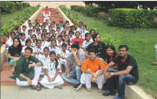
Bandhan Programe at ISB