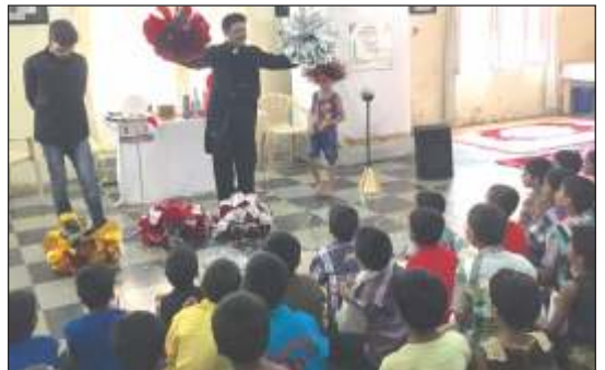
Magic Show was organized by the Rotary Club of Hyderabad Deccan