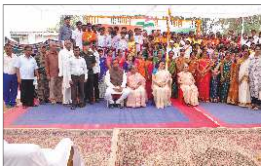
Members and Teachers