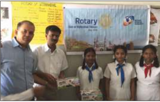
Rotary Club donating Shoes to the children