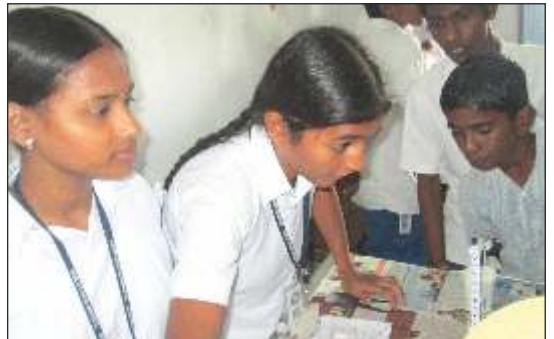
Science Fair at Nalgonda