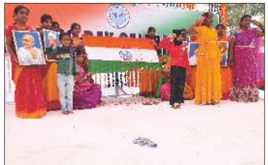
Cultural Programme by Balika Bhavan Girls