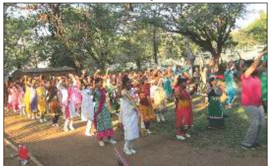
On 3rdFeb, 2017 Children attended a Zumba Dance activity in the Military Campus