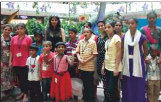
On 24th May, 2017 May children went to the FORUM mall with touch a Life Foundation Group