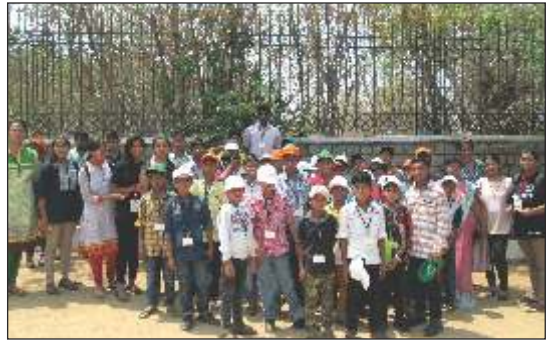
Vejbai Bal Nivas children enjoying Picnic at Botanical Garden