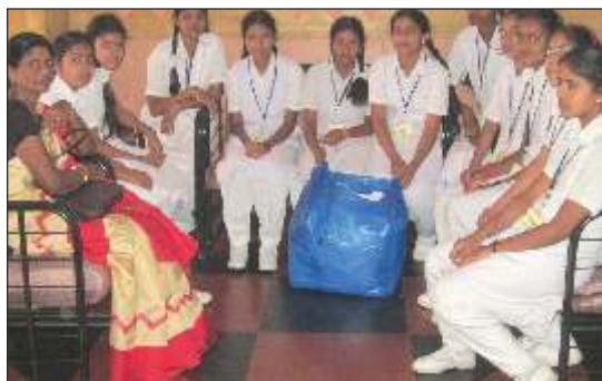
Vasavi Mahila Sangam donated school Uniforms