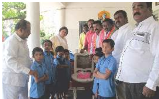
On 17th February, 2017 Birthday Celebrations of Sri. K.Chandrashekar Rao Chief Minister of Telangana State by Local TRS Party People.