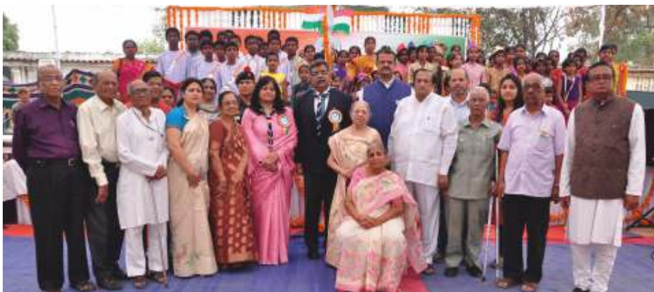
Executive Committee Members