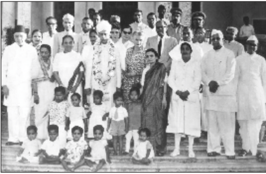
Dr. Sarvapally Radha Krishnan, the Vice-President of India inaugurated Radha Kishan Home on 6th January 1955