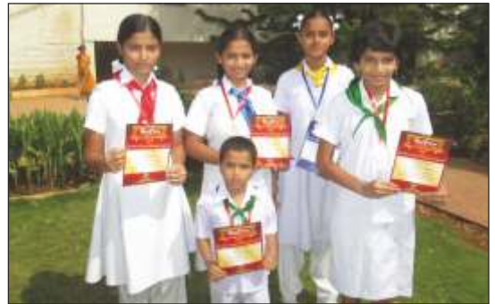
Children won the prizes in Painting competitions