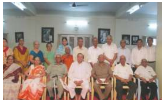
General Body Meeting