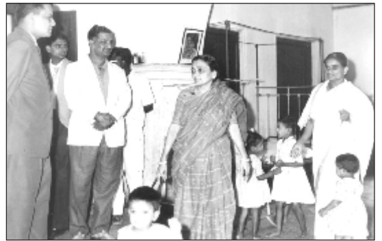
Former Chief Minister of A.P and Actor Sri. N.T Rama Rao Visited the R.K.Homes