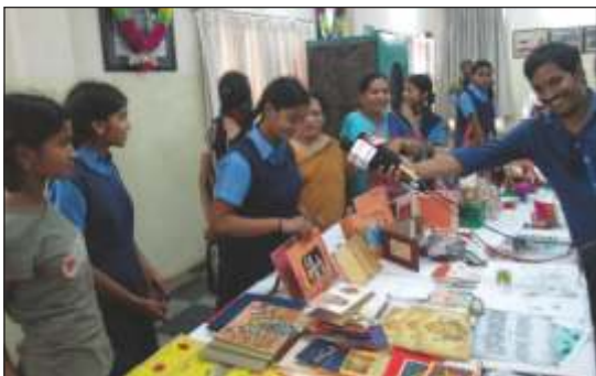
Art & Craft Exhibition