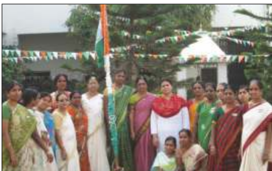
Independence Day Celebration in V. K. Dhage School