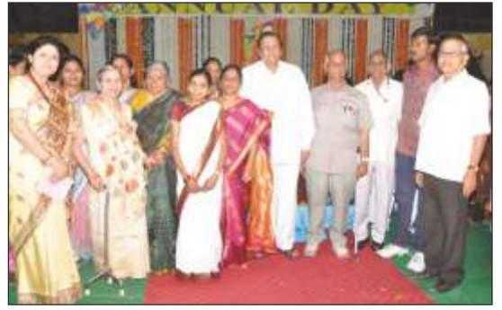
Annual Day Celebrations