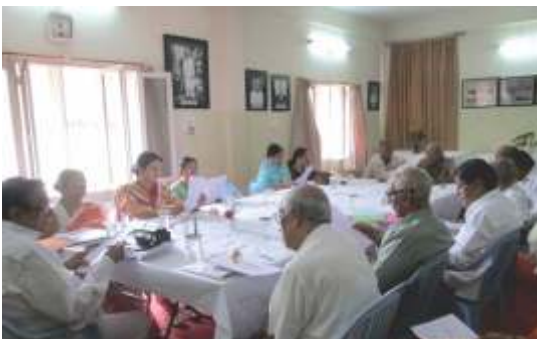
Managing Committee Meeting

The Hyderabad Children's Aid Society is having Income Tax Exemption under section 80 G of IT Act 1961. Under this the donors will get a rebate of 50% on the amount donated to Hyderabad Children's Aid Society. PAN NO. AAAAH0284Q.