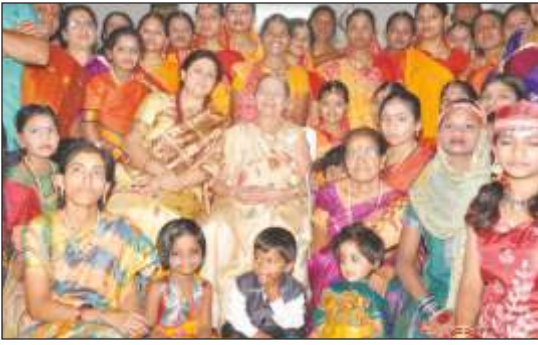
Annual Day Celebrations