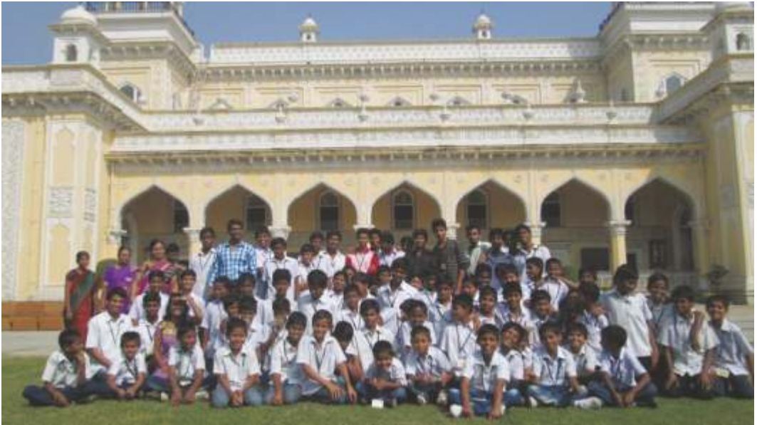
Vejbai Bal Nivas Children visited Chowmala Palace with the help of Donors

H) 53 children in Zilla Parishad High School, Shivarampally, Hyderabad-500 052.