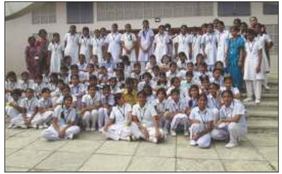
V. K. Dhage School Children visited Bapu Ghat