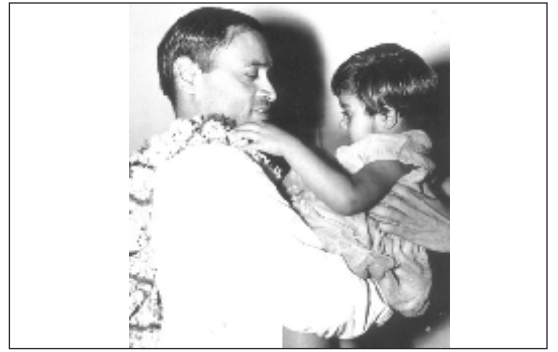
Former Prime Minister of India Sri P. V. Narasimha Rao Visited R. K. Homes