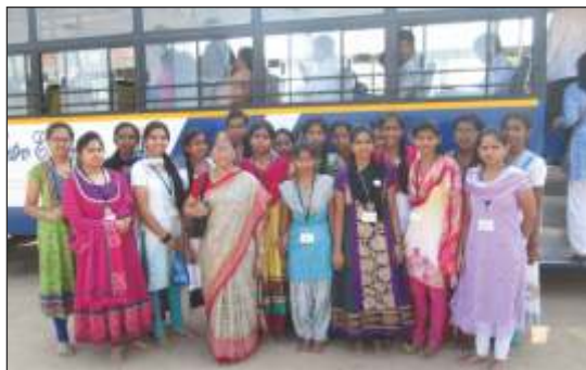
10th Class children visited Chilkur Balaji Temple