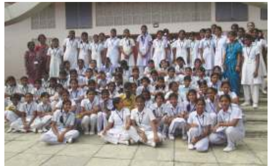
V. K. Dhage School Children visited Bapu Ghat