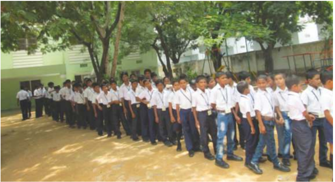
A group of Vejibai Bal Nivas Children