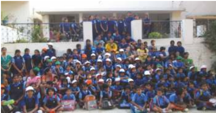
A group of V. K. Dhage School Children

Education:- Details of the children going to various schools and Colleges:-