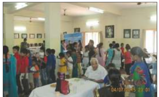
Medical Camp Conducted by Indian Medical Association