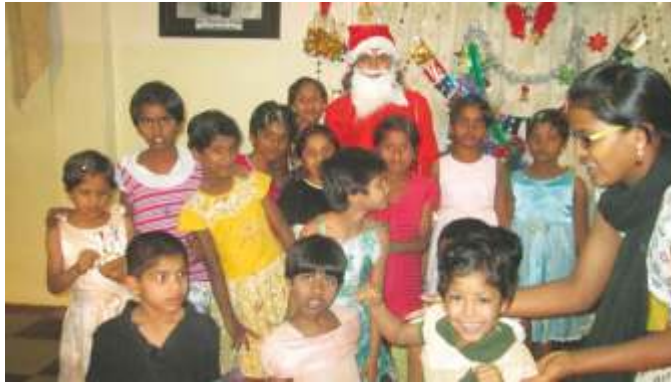
Christmas Celebrations in R. K. Homes