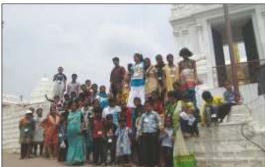
Sanghi Temple Visit