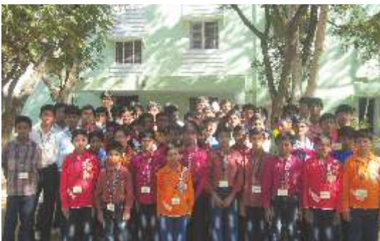
A Group of Children at VEJ BAI BALNIVAS