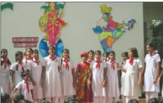
Independence Day Celebrations