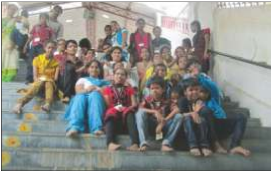
Sanghi Temple Visit in Summer Holidays