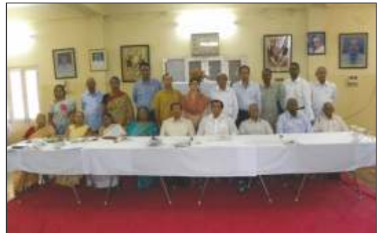
General Body Meeting