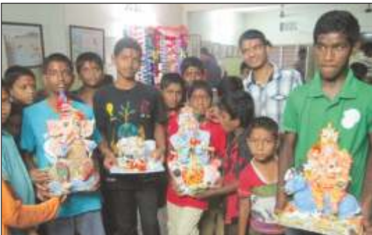
Vejbai Bal Nivas children made pollution free Ganesh idols