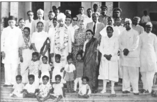
Dr. Sarvapally Radha Krishnan, the Vice-President of India inaugurated Radha Kishan Home on 6th January 1955