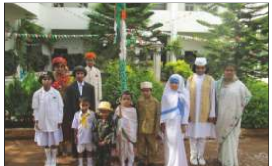
Independence Day Celebrations