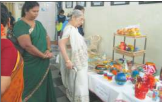
Art & Craft Exhibition