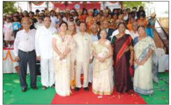
60 years celebrations