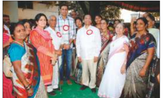
Sport Day, Chief guest Sri. VVS Laxman Indian Cricket Player