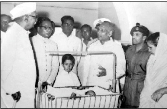
Dr. Rajendra Prasad, the first President of Independent India visited R. K. Homes.