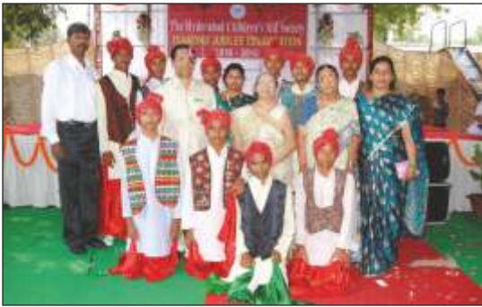
60 years celebrations with group of Vejbai Bal Nivas children and staff