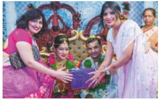
With Touch a Life Foundation Team