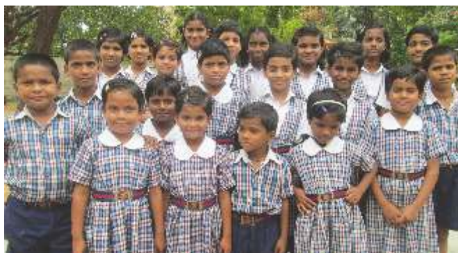
A group of International School Children

F) 21 children go to International School, Shaikpet, Hyderabad.