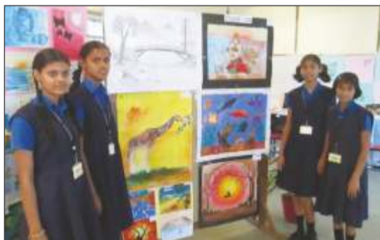
V. K. Dhage School Children visited Science Exhibition