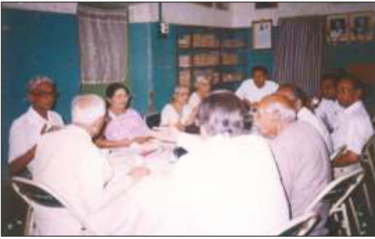
A Managing Committee Meeting