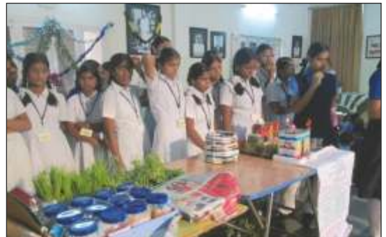
V. K. Dhage School Children participated in Science Exhibition