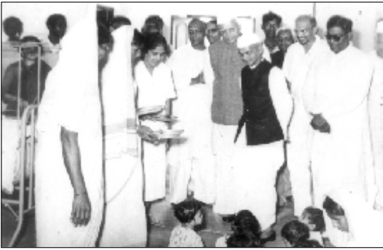
Sri Lal Bahadur Shastri visited R. K. Home