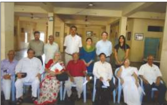
Managing Committee Members