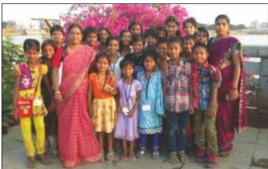
Outings in Summer holidays