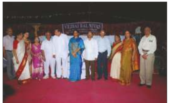
Annual Day Celebrations at Vejabi Bal Nivas Chief Guest Mrs. Sabita Indra Reddy